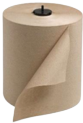
TOWEL PAPER HAND ROLL TORK 20612: 6/700Ft 1 ct