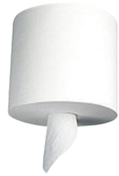
TOWEL CENTERPULL 2PLY 20615: 6/600Ft 1 ct