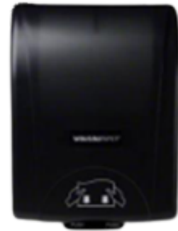
DISPENSER HND5 FREE BLK OPTI SERV 20181: 1 ct