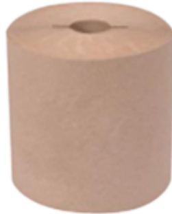
TOWEL ROLL NAT 20607: 6/800Ft 1 ct