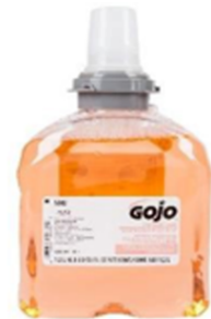
SOAP FOAM ANTIBAC TFX GOJO 2/1200ML 19087: 1 ct