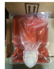
DISPENSER GOJO NO-TOUCH FOAMING 18299: 1ct