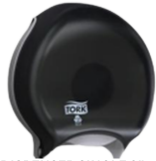
DISPENSER SINGLE 9" TOILET TISSUE 20171: 1 ct