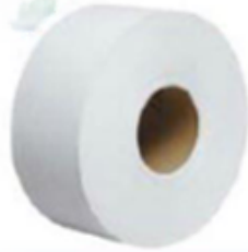
TISSUE TOILET 2 PLY 18234: 12/1000Ft