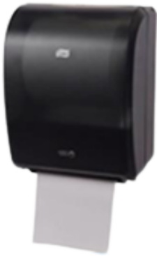
DISPENSER ELECTRONIC TOWEL BLCK 20683: 1 ct