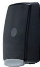
DISPENSER MANUAL FOAMING BLK 99277: 1ct