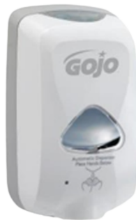
DISPENSER GOJO NO-TOUCH FOAMING 20156: 1 ct