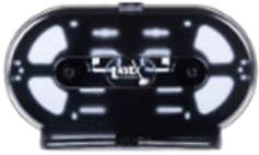
DISPENSER DBL 9" TOILET TISSUE 20161: 1 ct