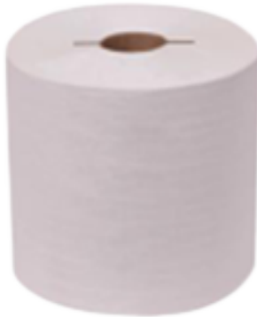
TOWEL ROLL NAT WHT 20608: 6/800Ft 1ct