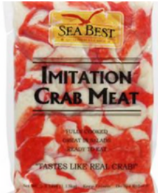
CRABMEAT IMITATION 14071: 12/2.5#