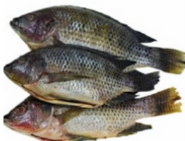
TILAPIA CLEAN 14054: 350-550 Gram 40# 14051: 550-550 Gram 40# 14058: 750 Gram up 40#