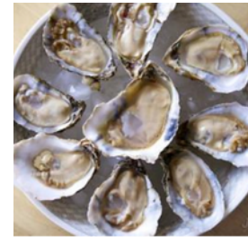
OYSTER HALF SHELL FZ 14005: 144 CT