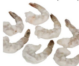
SHRIMP RAW T/ON P&D 14002: 31/40 5/2#