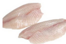
TILAPIA FILLET IVP 14048: 3-5 oz 10# 14049: 5-7 oz 10# 14052: 7-9 oz 10#