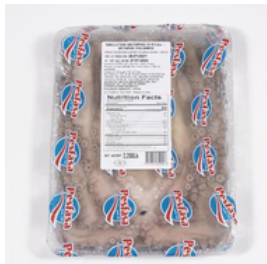
OCTOPUS SPANISH 10105: 2-4 Avg 28#