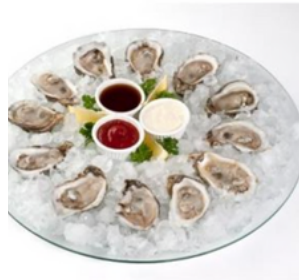
OYSTER HALF SHELL FZ HILLMAN 10200: 1/30#