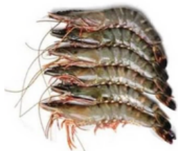
SHRIMP RAW PRAWN HOSO 14059: 4/6 10/4# 14076: 6/8 10/4#