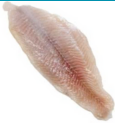
CATFISH FILLET SHANK IQF 14024: 7-9oz 15#