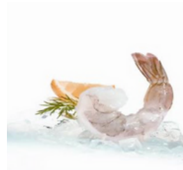
SHRIMP RAW T/ON P&D 14077: P&D 13/15 5/2# 14006: P&D 16/20 5/2# 13999: P&D 21/25 5/2# 14012: P&D 26/30 5/2#