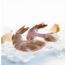
SHRIMP RAW EZPL 10107: 21/25 5/2# 10106: 31/40 5/2#