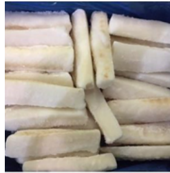
COD LOIN FILLET IQF 10202: 10/1#