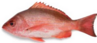
RED SNAPPER CLEAN 10099: 1-2# 10# 17659: 2-3# 22#