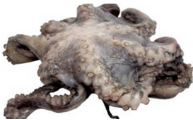
OCTOPUS 14000: 2-4# Avg 30#