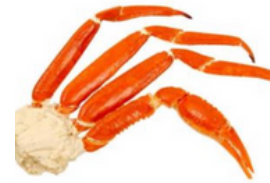
CRAB LEG SNOW 14042: 5-7 oz 30# 14060: 8 Up 30#