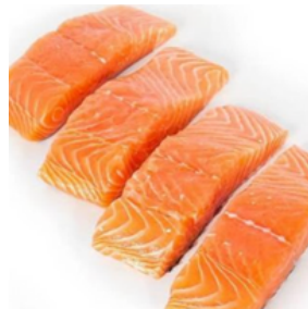
SALMON BONLS/SKNLS 20807: 6 oz 10# 17359: 8 oz 10#