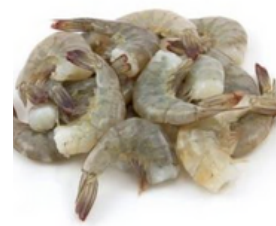
SHRIMP RAW HLSO 10108: 16/20 T/Off 6/4# 14016: 26/30 T/On 10/4# 14013: 41/50 T/On 10/4#

Disclaimer: The images shown are for illustration purposes only and may not be an exact representation of the product.