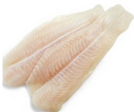
SWAI FILLET N-BN N-SKIN IQF 17605: 7-9 oz 15#