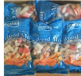
MIX SEAFOOD 24034: 24/1#