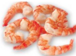
SHRIMP CKD P&D 14015: 16/20 T/Off 5/2# 14022: 31/40 T/On 5/2# 14019: 41/50 T/On 5/2#