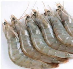
SHRIMP RAW HOSO 10201: 20/30 10/4# 13992: 30/40 10/4# 14014: 40/50 10/4#