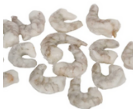
SHRIMP RAW T/OFF P&D 13994: 31/40 5/2# 14003: 41/50 5/2# 14009: 51/60 5/2#