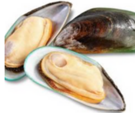
GREEN MUSSELS HALF SHELL NZ 10109: 12/2#